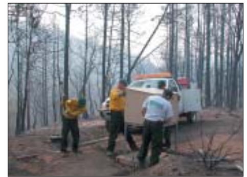
USGS hydrologic technicians install the gage house that will hold equipment for monitoring the streamflow of Carrizo Creek in the Rodeo/Chediski burn area. Photograph by C. Smith, USGS, June 30, 2002.