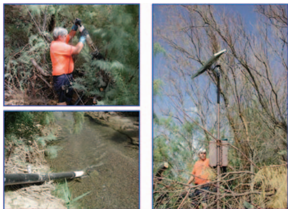
Water quality monitoring and data transmission in the Las Vegas Wash area.

Five sites in the wash and its tributaries (see map), including Las Vegas Creek (LW12.1), Duck Creek (DC_1), upstream of Pabco Erosion Control Structure (LW6.05), downstream of Pabco Erosion Control Structure (LW5.9), and below Lake Las Vegas (LW0.8), have been selected for near-real-time water quality monitoring. Las Vegas Creek and Duck Creek are two of six major tributaries to the wash. They capture urban runoff from northwest and southwest parts of the Las Vegas Valley watershed. Sites LW6.05, LW5.9, and LW0.8 are located in the mainstream of the wash; LW5.9