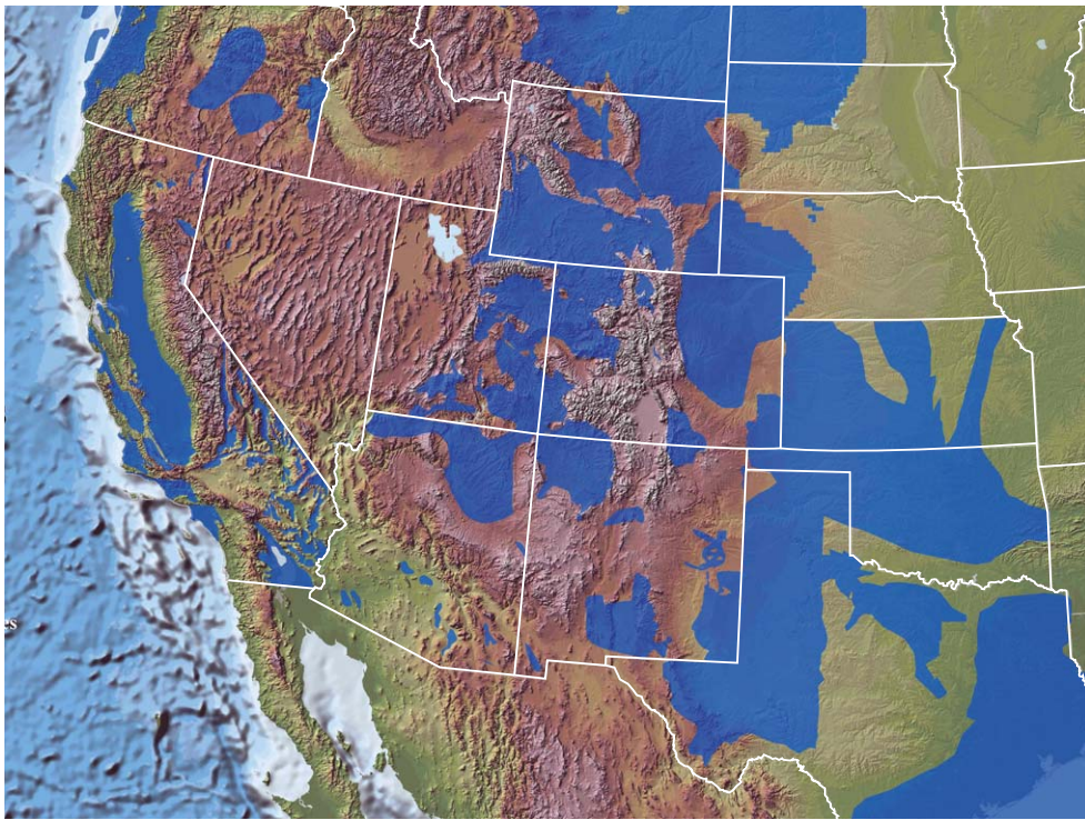
Deep saline formations (shown in dark blue) are prevalent throughout much of the Southwest and offer the largest potential CO 2 storage capacity (from NETL, 2008).