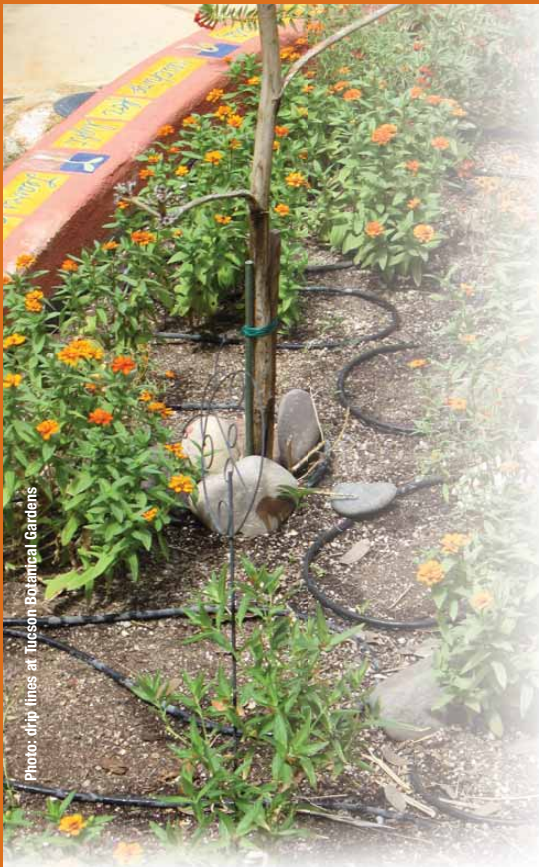
Photo: drip lines at Tucson Botanical Gardens

per day (GPCD). Should a continued reduction of GPCD over time equate to a measurement of conservation? The answer is complicated. Numerous aspects affect a drinking-water supplier's GPCD, such as demographics, climate, economics, and availability of supply. These can change over time to influence GPCD, but the calculation of GPCD itself must remain constant if valid use comparisons are to be made. Yet staffing changes, public-image pressures, and other influences have caused drinking-water suppliers to modify their GPCD calculations, further complicating the evaluation of conservation efforts.